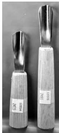
5/8" Ocular gouge - #12234.....$26.75 Specify short or long handle