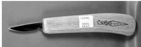
1-3/8" Upsweep Knife #12046.....$23.75