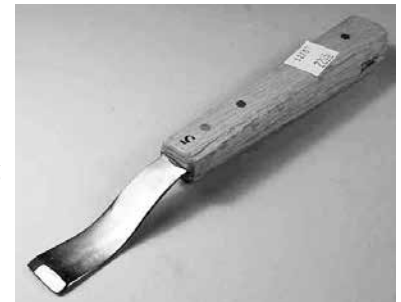
3/4" #5 back bent gouge #12202.....$22.95